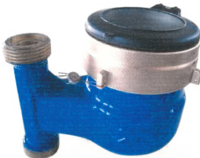
Figure 4: The water meter type ERCIYES MJD-xx-T (E5) with inclined calculator – view: